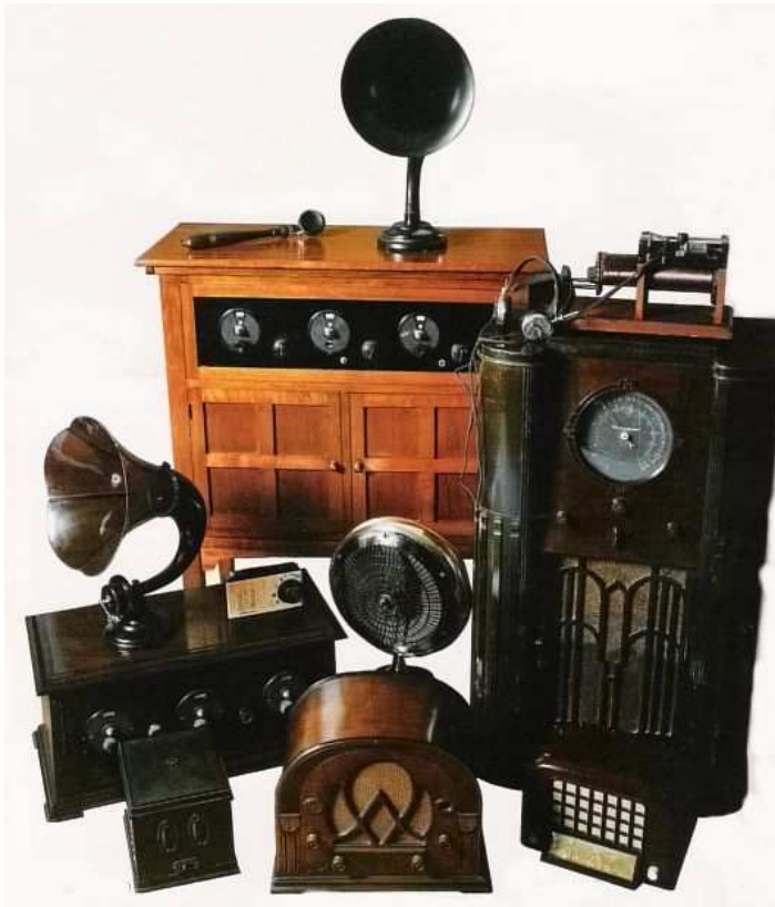
These old radios were used in the early days of broadcasting in South Africa.

Chairman: Secretary / Treasurer: Repeater/Packet Radio/Technical Shacknews Editor: Shacknews-Print & Posting: Website Manager QSL Manager: